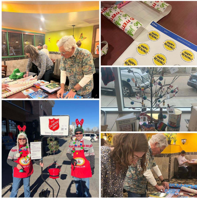
Sunset Rotary International Tree for the TLC Christmas Tree Festival; Book Wrapping at Sunset Club on Thursday; and Bell Ringing on Friday.