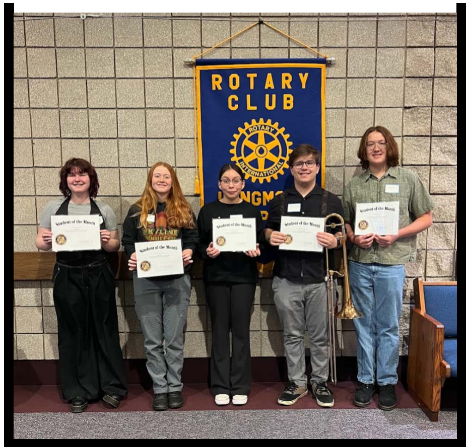
Congratulations to our Students of the Month, their teachers, counselors, principals and families!